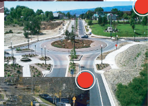
Grand Junction, Colorado