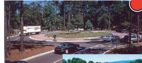
Hilton Head, South Carolina

safe, efficient and attractive traffic control