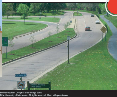
Image from the Metropolitan Design Center Image Bank. © Regents of the University of Minnesota. All rights reserved. Used with permission.

SOURCE: Moscow, ID Greenbelt Parkway Presentation Prepared by Steve Hollenhorst and SilviaFerrin for joint meeting of City Council, Parks & Rec and Paradise Path Task Force